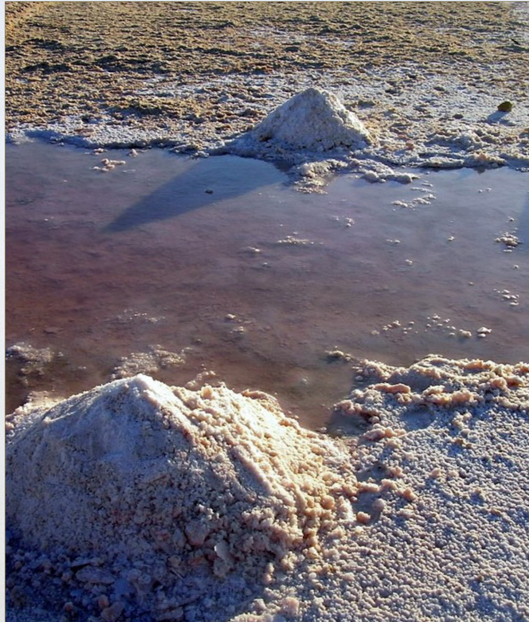
SOIL CONTAMINATION FROM SALINE WATER IMPACTS WATER QUALITY AND ALTERS SPECIES HABITATS.